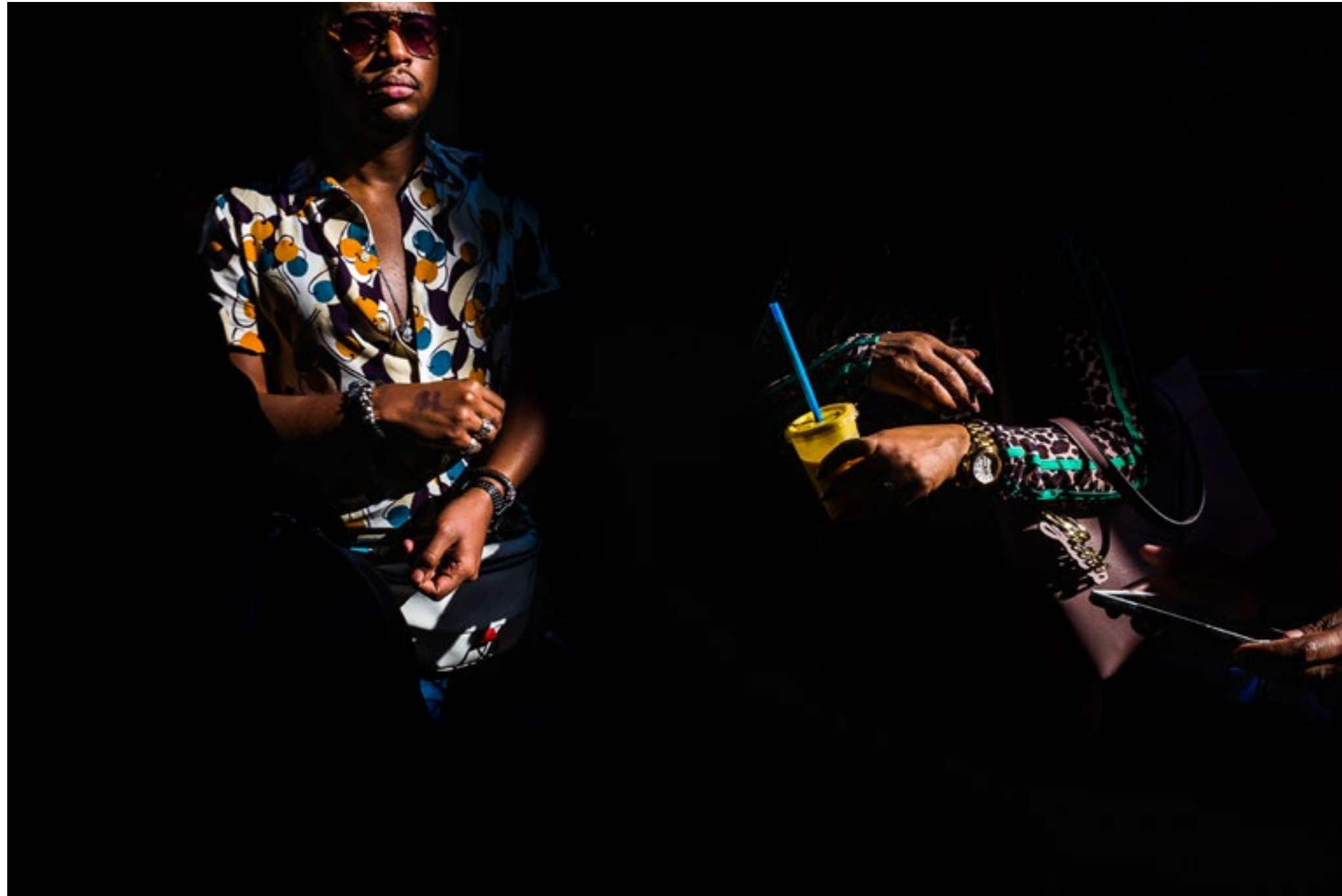
Untitled, from the series "The Straw Conspiracy"