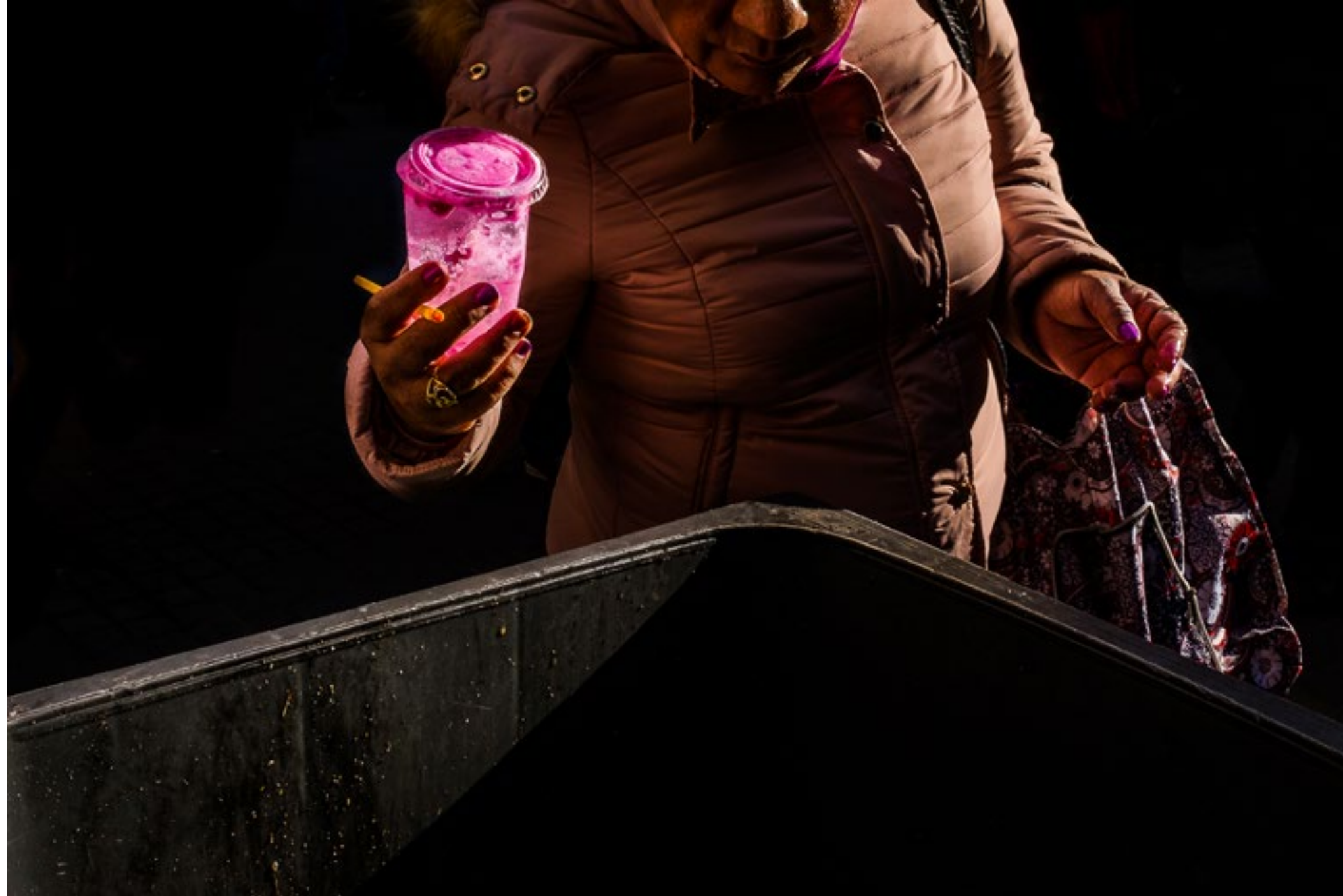
Untitled, from the series "The Straw Conspiracy"